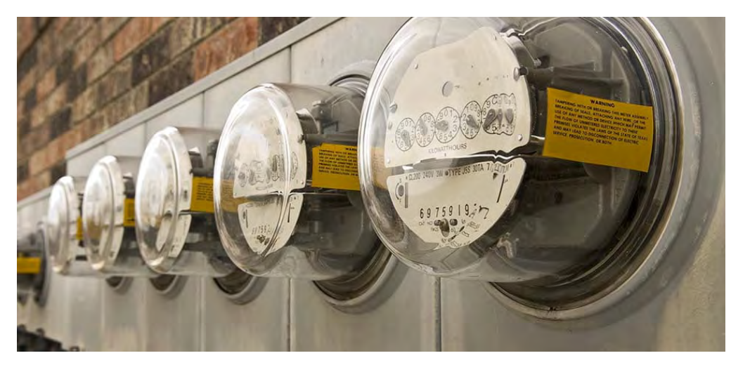
278,679 homes' electricity use for one year

333,661 passenger vehicles driven in one year