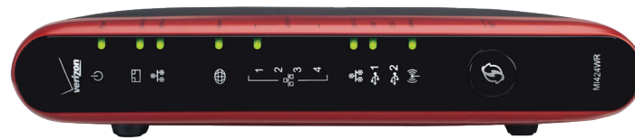
Fios Advanced Wi-Fi Router

E. The Wi-Fi indicator light on your Fios router should be off.