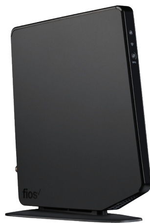
Fios Quantum Gateway