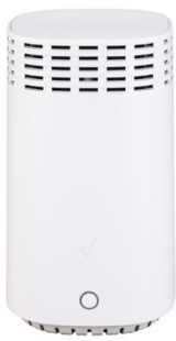
Fios Home Router